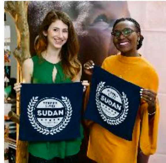
Our staff celebrated Giving Tuesday with live-streaming events and rewards for donors.

*This metric includes both cash raised and the fair-market value of investments donated to our Endowment Fund. We also include grants and institutional giving in this metric.