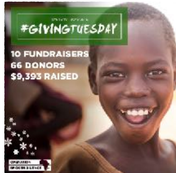
Giving Tuesday 2017 was once again our largest day of giving for the year.