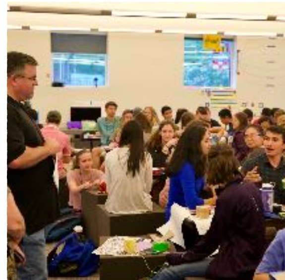
Tennessee Governor's School For International Studies students work on a communications project for the Yida Photography Exhibit.