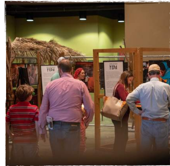
Attendees at a Yida Photo Exhibit showing prepare to give at the Get Involved table

*This metric includes both cash raised and the fair-market value of investments donated to our Endowment Fund. We also include grants and institutional giving in this metric.