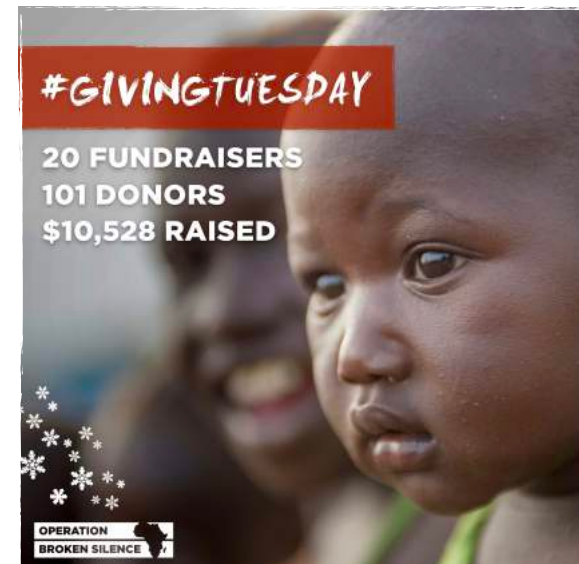
Giving Tuesday was once again our largest day of giving for the year.