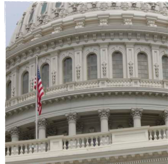
Tennessee's Representatives heard your voices loud and clear at the Capitol.