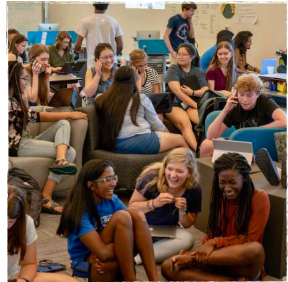
High school students from across Tennessee called on Senator Corker to move the Elie Wiesel Act forwards during an advocacy day.