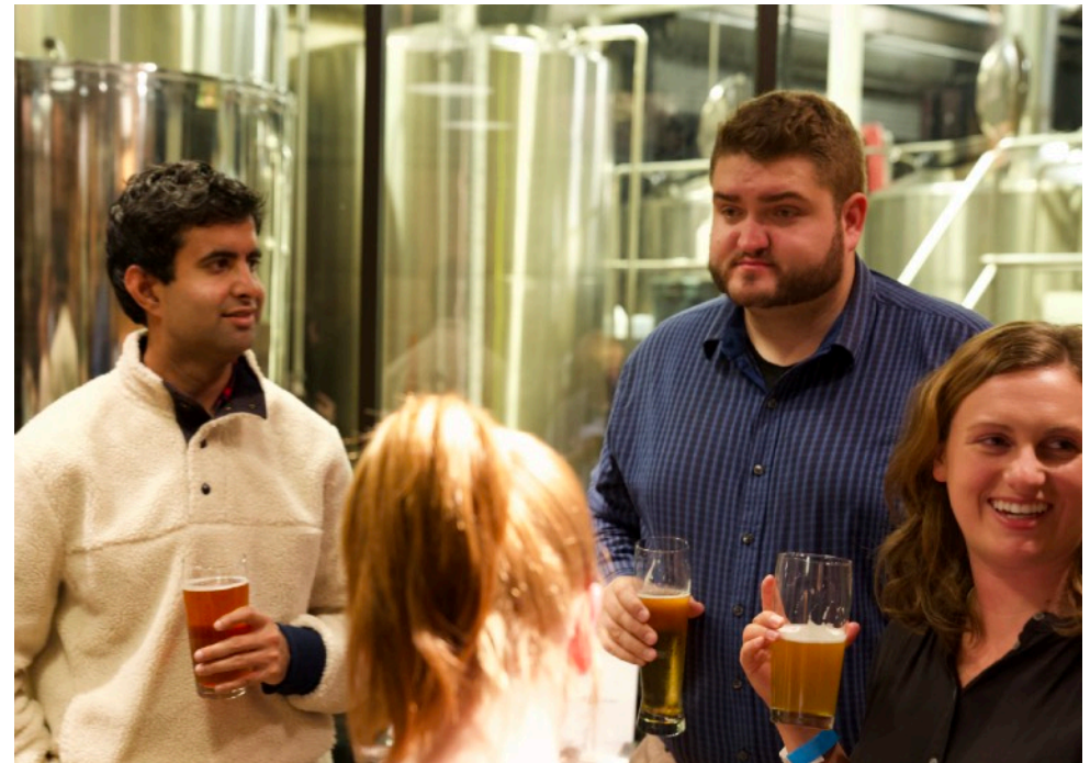
Giving Tuesday at brand partner Wiseacre Brewing Company.